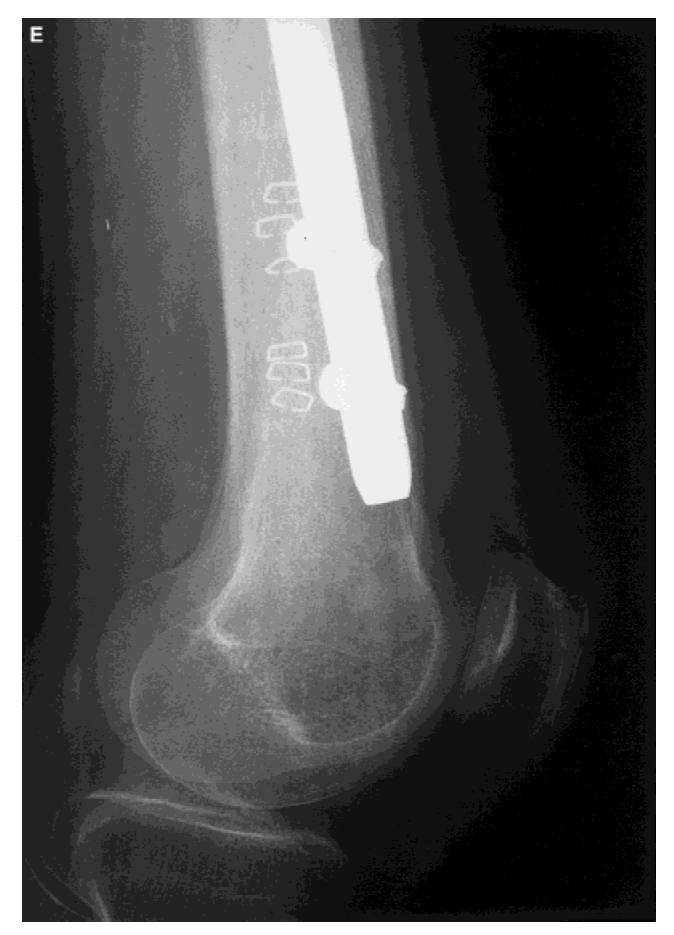
Fig. 2. Anterior cortical penetration. Anteroposterior radiographs of (A) hip and (B) proximal femur showing impending pathologic femur fracture in patient with metastatic prostate carcinoma. C: Postoperative anteroposterior radiograph of the hip following placement of the long Gamma nail. D: Postoperative anteroposterior radiograph of the distal end of the femur showing apparent acceptable position of two distal interlocking screws. However, review of the lateral radiograph (E) shows that the distal tip of the nail has partially penetrated the anterior cortex. Despite this finding, the patient was allowed immediate full weight bearing postoperatively and progressed to excellent pain relief without loss of fixation or fracture.

was independent without aids following seven procedures, assisted ambulation with a walker following four procedures, and assisted ambulation with a cane following two. Eight of the eleven patients, including all those who were nonambulatory or walked only with ambulatory aids preoperatively, improved at least one ambulatory level following 10 of the 13 procedures. Only one patient, who died 2 months postoperatively, failed to regain his preoperative ambulatory independence. Two additional patients who walked independently preoperatively returned to that level. One patient who had improved from a preoperative bedridden status to postoperative independent ambulation with a walker subsequently required a wheelchair secondary to impending paraplegia from disseminated inoperable spinal metastases just prior to her death. A second patient who had improved from walker ambulation to independent ambulation with a cane postoperatively later suffered lower extremity paralysis from a pathologic spinal fracture that left him