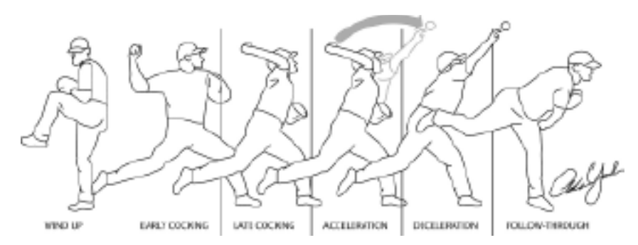
Figure 1. The phases of the throwing motion.

Increased retroversion may, on the other hand, predispose the thrower to increased posterior capsular strain during follow through. Thomas et al (unpublished data) have demonstrated increased posterior inferior capsular thickness in throwers with increased retroversion, as determined with ultrasound. It appears that the loss of internal rotation seen with greater degrees of retroversion impose more demand on the posterior capsule during deceleration.