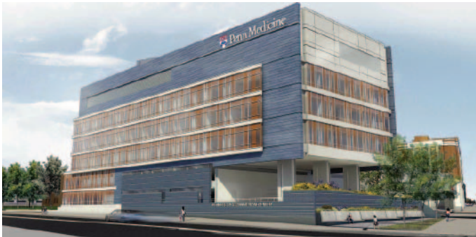
Rendering of the Pavilion for Advanced Care on the PPMC campus.

The Penn Presbyterian Medical Center (PPMC) Cornerstone project is well underway as the construction on both corners along 38 th Street proceeds onward and upward.