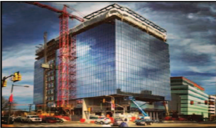
Penn Medicine University City under construction.

The 13-story state-of-the-art facility housing “Penn Medicine University City,” located on the corner of 38 th and Market Streets, is nearly complete. The new building contains eight floors of brand new space for ambulatory care and is due to open in August 2014. The University City tower will be the new home of the academic offices of the Department of Orthopaedic Surgery. The Penn Musculoskeletal Center on the 7 th and 8 th floors will occupy over 38,000 square feet of the tower and is complimented by services and programs tailored to the care of the musculoskeletal patient that occupy much of the remainder of the building. These include a full-service musculoskeletal imaging unit with Xray, 3T MRI, CT, ultrasound, and dexa scan; outpatient laboratory; pre-admission testing unit; pharmacy; the six operating room PPMC Surgery Center; the Penn Center for Human Performance, and a floor of outpatient therapy provided by Penn Therapy and Fitness.