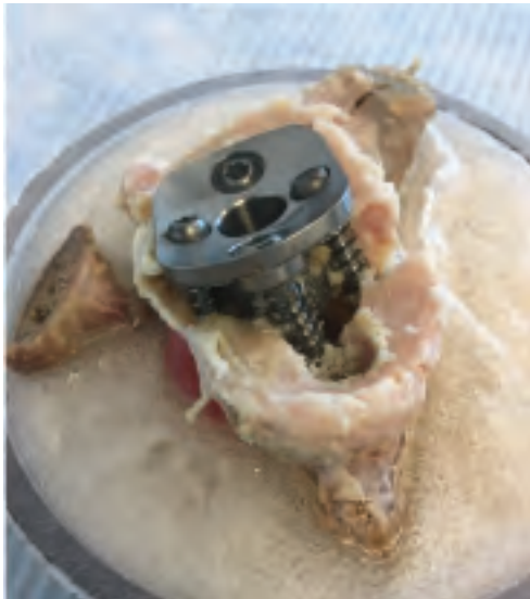
Figure 2. Photograph of a specimen after catastrophic failure. Implant is separated from the scapula at the bone-baseplate interface.

subsequently compared with 1-tailed paired student t-tests. Axial stiffness, deformation, ultimate load, and survived cycles were measured.