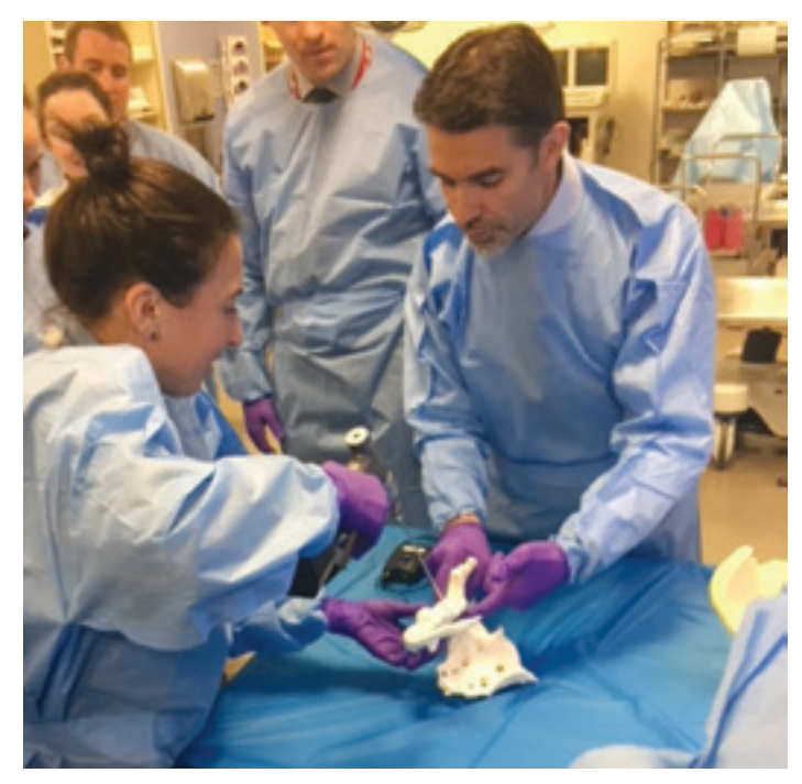
Figure 2. Residents practicing placement of the Ice Cream Cone Prosthesis

the "Ice Cream Cone Prosthesis". Following the sawbones, we enjoyed a captivating prosection of the iliofemoral approach to the acetabulum that is not commonly seen in our program further adding educational value.