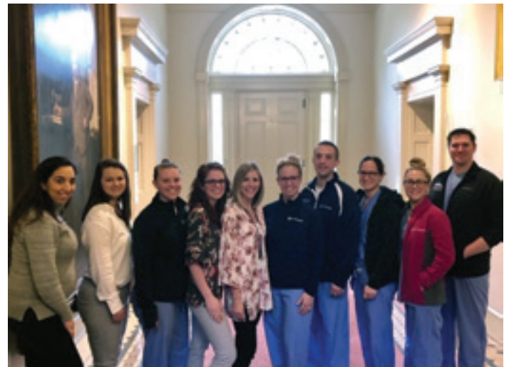
Figure 1. Some of the many APPs after a meeting at Pennsylvania Hospital

In summary, the advanced practitioners of Orthopaedic surgery are highly valued members of the clinical care team. I would like to take this opportunity to personally congratulate the advanced practitioners on their achievements and thank them for their endless dedication and commitment to the department and patients.