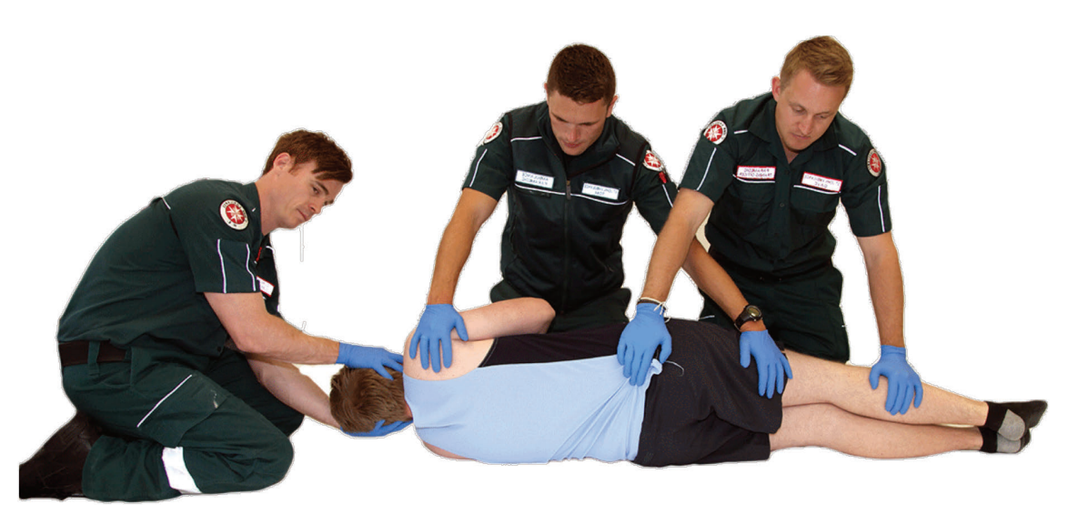
Figure 1. Example of a logroll of a patient to maintain spinal precautions. One person stabilizes the head and neck and two others carefully support the thoracolumbar region.

Spine reflexes should also be tested by the consult resident. The following spinal nerve levels are associated with the corresponding reflex. C5= biceps brachii reflex. C6= brachioradialis reflex. C7= triceps brachii reflex. L1/2= cremasteric reflex L4= patellar tendon reflex. S1= Achilles tendon reflex.