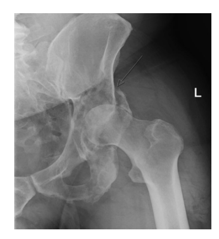
Figure 2. X-ray with comminuted, pathologic fracture of the superolateral left acetabulum. Nondisplaced, comminuted fracture of the inferior pubic ramus.