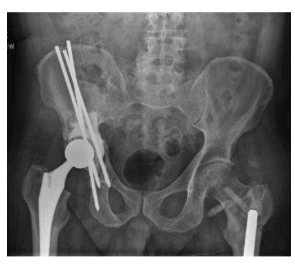
Figure 5. Steinmann pins fixed distally into the ischium or pubic ramus provides additional stability.