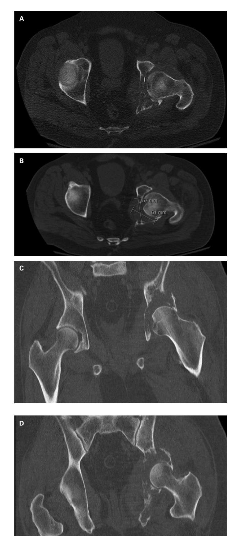
Figure 3. CT pelvis with pathologic fracture of left acetabulum through extensive lytic lesion.

X-rays of the pelvis and left hip and were obtained confirming a pathologic fracture of the left acetabulum. Subsequent CT abdomen and pelvis revealed a pathologic, comminuted fracture of the left acetabulum through an underlying lytic lesion (6cm x 6cm) and further involvement of the surrounding bone, including the anterior wall/ column and ischium (Figure 3).