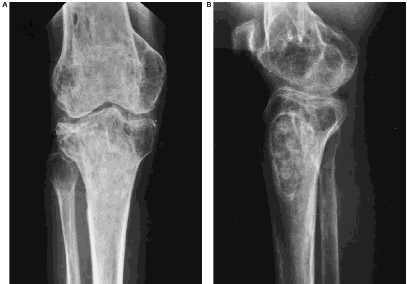
Fig. 3. Patient with osteomyelitis of proximal tibia seven months after treatment. A: Anteroposterior view shows no further evidence of recurrent osteomyelitis. B: Lateral view showing good incorporation of bone graft in proximal tibia.