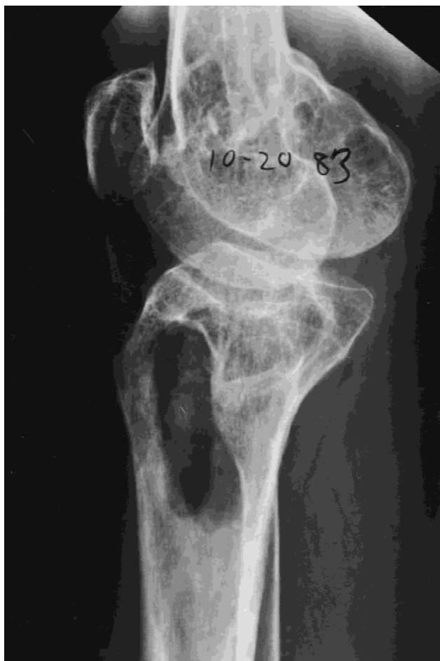
Fig. 2. Lateral radiograph of a patient with osteomyelitis of proximal tibia. This shows wide debridement of the involved area.

In a limited series of patients treated in this fashion, all patients had multiple operative procedures until there was evidence that the infection was eradicated and the wound appeared to be healing [51]. Patients averaged 4.2 debridements (range, three to eight). Two of 13 patients required plastic surgery reconstructive procedures for wound coverage and/or filling of dead space. Each of these also required split thickness skin grafts to cover harvest sites or free muscle pedicle flaps. Two patients had resection of their infected bone: one patient required a talectomy and arthrodesis and the other required hip disarticulation. The disarticulation was necessary due to the extensive nature of her disease, a lack of viable bone stock, and severe osteoporosis. One patient, at the completion of his surgeries, had a