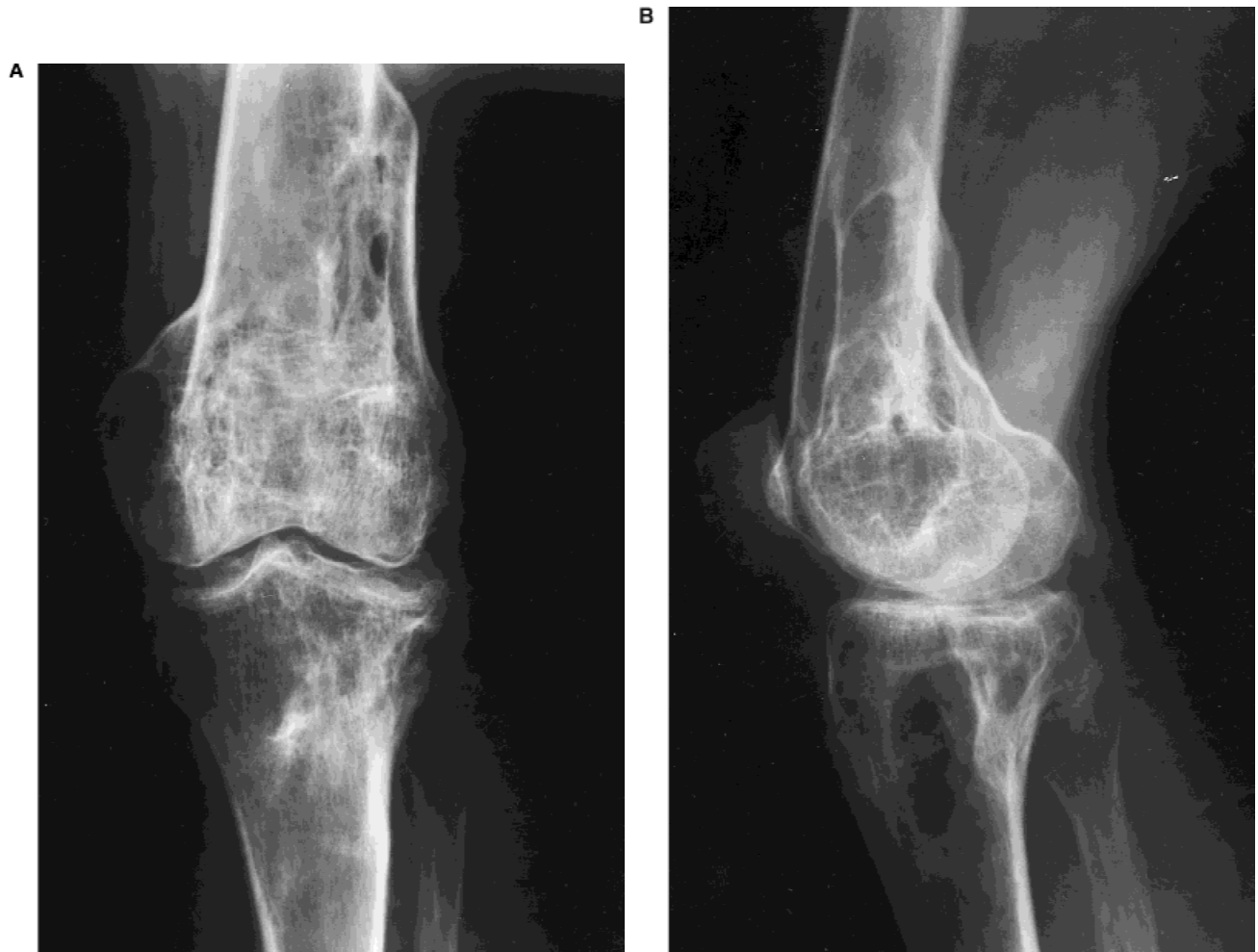
Fig. 1. Preoperative radiographs. A: Anteroposterior view shows areas of lucency of medial proximal tibia. B: Lateral view shows well-defined lytic region of osteomyelitis.

In those instances where the structural integrity of the bone appears compromised, autologous bone grafting can