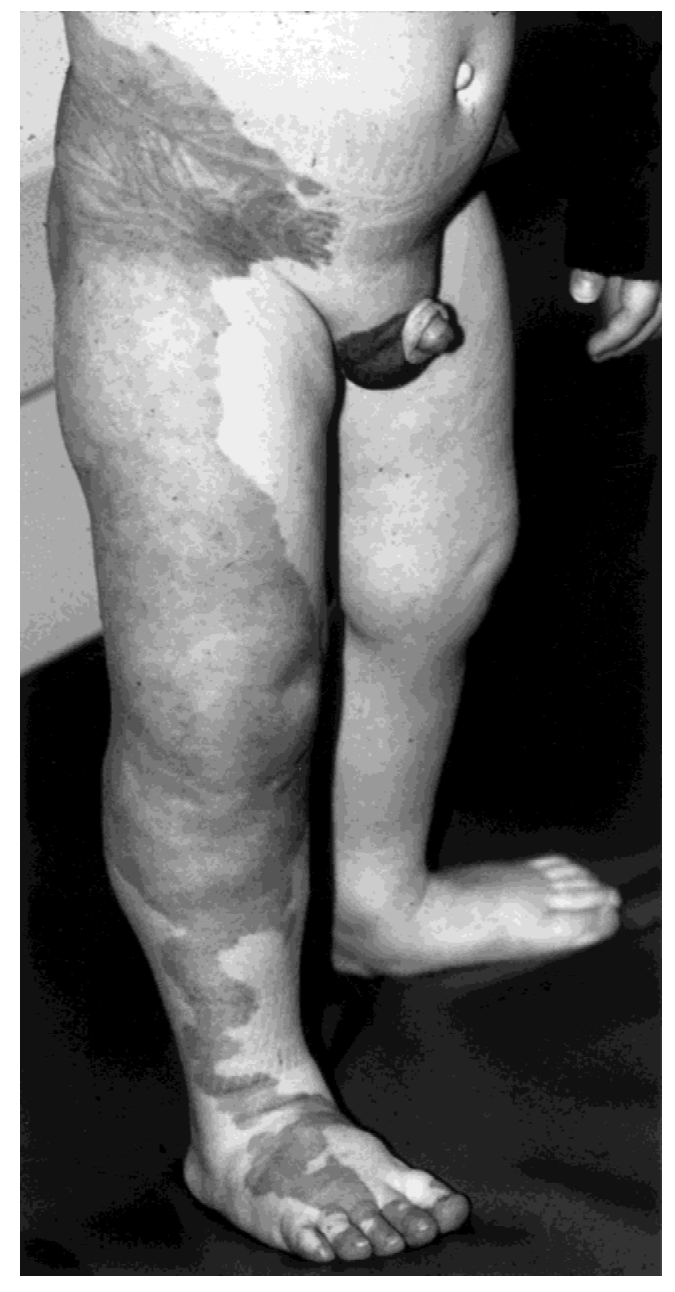
Fig. 3. Klippel-Trenaunay Syndrome involving the right lower extremity.

Treatment of slow-flow mixed-type malformations should emphasize compression garments to decrease the chronic lymphedema and venous engorgement since control of these symptoms may prevent or slow the skeletal hypertrophy seen in Klippel-Trenaunay syndrome [4,14,16,18]. Sclerotherapy, vein stripping, or debulking procedures can be done in selected instances, but evaluation with MRI or venographic studies is necessary beforehand to insure that anomalous superficial veins essential to extremity drainage are not removed [6]. Laser therapy is used for control of superficial vesicle formation. Sclerotherapy and staged debulking procedures are occasionally used for palliative treatment, however, complete excision of mixed malforma-