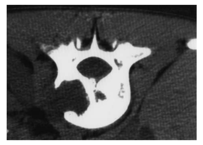
Fig. 1. CT image demonstrating a destructive LCH lesion of a lumbar vertebral body.

Many lesions share a common natural history detectable on radiography. Initially, aggressive lesions throughout the body may be associated with a permeative pattern of destruction with poorly defined margins [14]. These manifestations are often seen early in the progression of the lesion, when the bone cannot react fast enough to the destruction. Later, with progression of the disease, the lesion may become less active, and healing occurs. This gives a radiographic image signified by trabeculation of the lytic areas,