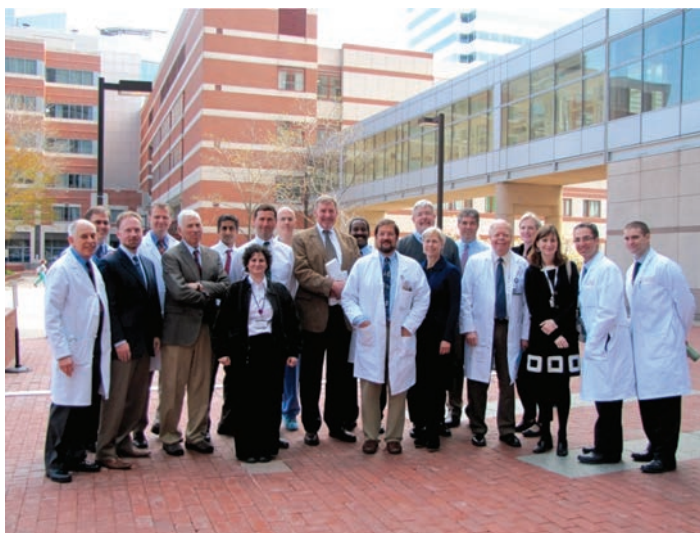
Figure 1. A few members of the CHOP Orthopaedic team during the Jesse T. Nicholson Visiting Professorship event in May of 2011.

Our orthopaedic faculty (Figure 1) continues to expand and is currently comprised of twenty one total providers, including eighteen specially trained pediatric orthopaedic surgeons (fourteen operative and four non-operative), and three pediatricians with sports medicine training.