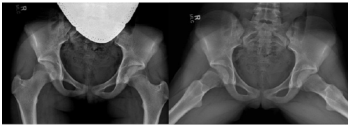
Figure 1. Anterior-posterior and frog lateral radiographs of the bilateral hips and pelvis. Mild CAM deformities can be seen on both femoral necks in the lateral view.