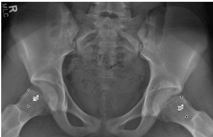
Figure 2. Frog lateral radiographs of the bilateral hips and pelvis with CAM deformities on both femoral necks (white asterisks). Alpha angles were measured and found to be 73 and 68 degrees for the right and left hips respectively.