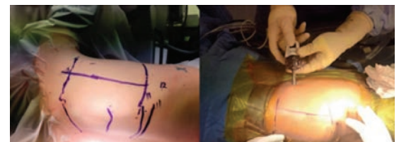
Figure 1. Marking of levels is done prior to procedure start under fluorosc, guidance. Anterior portals are established in the anterior axillary line.

Posterior portals are then established along the previously marked line to facilitate direct lateral trajectory to the spine for instrumentation. 15mm cannulas are used. Local anesthetic