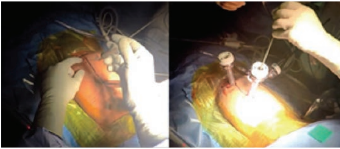
Figure 2. Posterior portals are established along previously marked area. Local anesthetic is infiltrated and can help localize.

infiltration into the intended interspace can be helpful and the needle used to directly visualize the trajectory (Figure 2). Usually two to three levels can be instrumented through one interspace portal. The number of posterior portals will be dictated by the number of instrumented levels planned. Levels are instrumented sequentially distally to proximally starting with pronged centering staples impacted into the mid portion of the lateral vertebral bodies. Bone wax is placed into the staple to maintain hemostasis and placement checked with fluoroscopy. A tap is used through the staple and trajectory confirmed fluoroscopically. The far cortex should be carefully penetrated for bicortical fixation. Screws are placed followed by the flexible tether which is manipulated into the tulips and secured with set screws. An external tensioning device is used to take any slack out of the tether and initiate correction before final tightening (Figure 3).